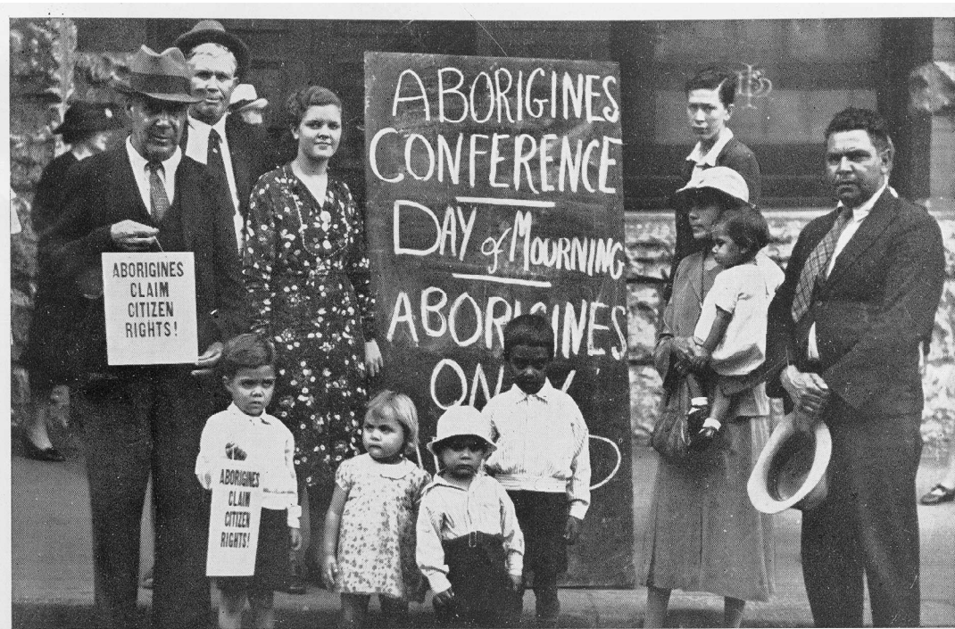
A LARGE BLACKBOARD displayed outside the hall proclaims, "Day of Mourning." Leaflets warned that, "Aborigines and persons of Aboriginal blood only are invited to attend." At 5 o'clock in the afternoon resolution of indignation, protest, was moved, passed.

On 26 January 1938, while many Australians celebrated the 150th anniversary of the landing of the First Fleet, a group of over 1000 Aboriginal people gathered at Australia Hall in Sydney to call for full citizenship status' and laws to improve the lives of First Nations people. As one of the first major civil rights gatherings in the world, this day became known as the Day of Mourning. Since then, National NAIDOC Week has grown to become both a commemoration of the first Day of Mourning as well as a celebration of the history, culture and excellence of First Nations people. National NAIDOC Week is observed annually from the first Sunday in July until the following Sunday.